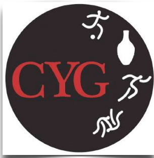
Columbus Youth Guild